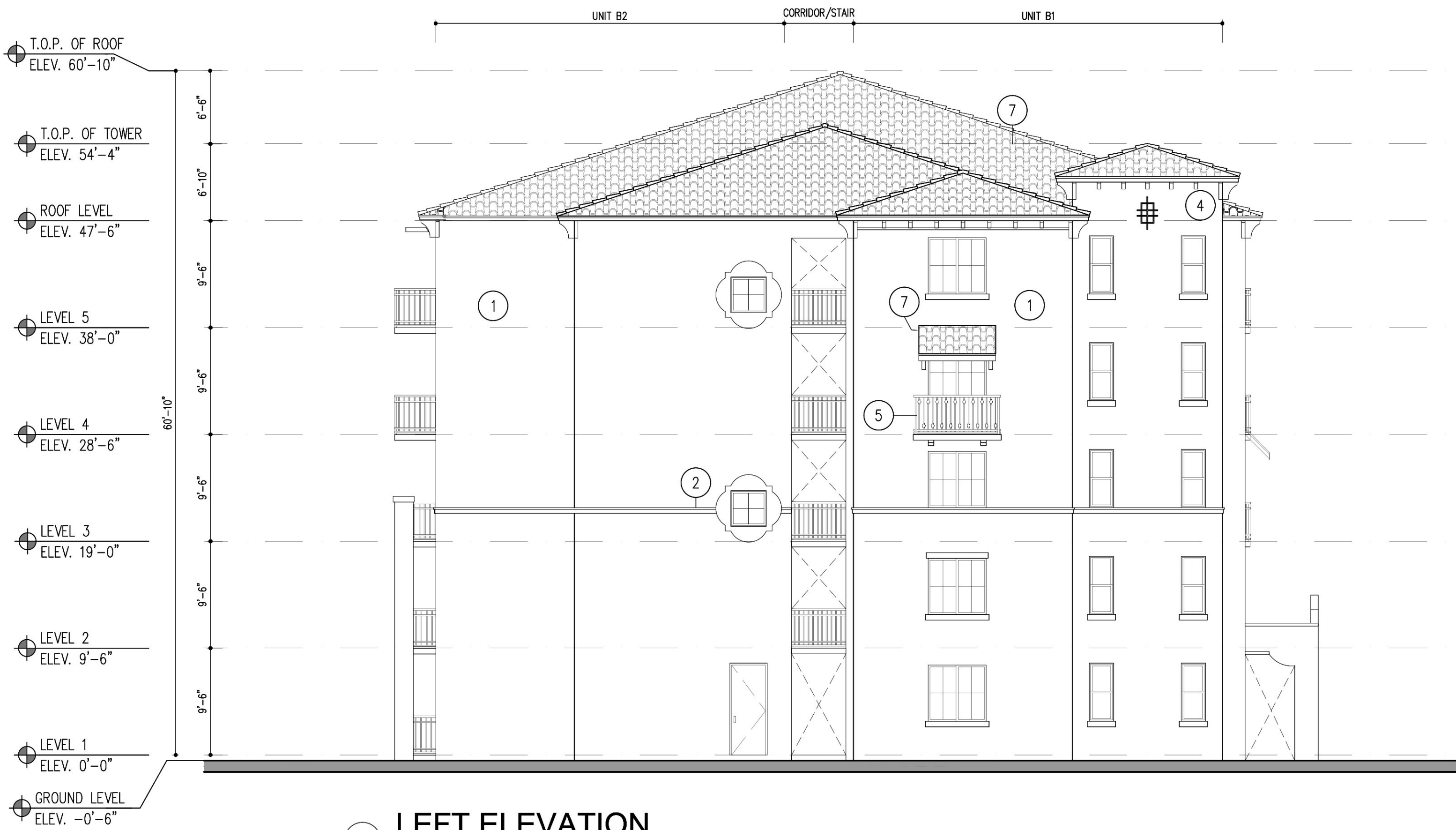
4 LEFT ELEVATION